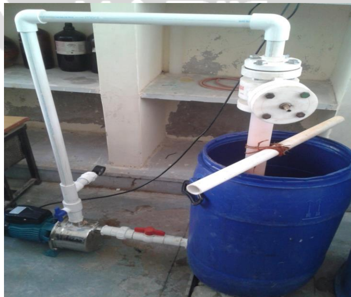
FIG. 1 HYDRODYNAMIC CAVITATION REACTOR

For hydrodynamic cavitation, experiments were performed in reactor of capacity 50 liters in which effluent was lifted and circulate by the pump of capacity 1 H.P. for different intervals of time without use of any chemical. Sample was kept for quiescent condition for 2 hours for the settlement of the precipitate. All experiments were carried out in batch mode. Several set of experiments were carried out to check the optimum range of time.