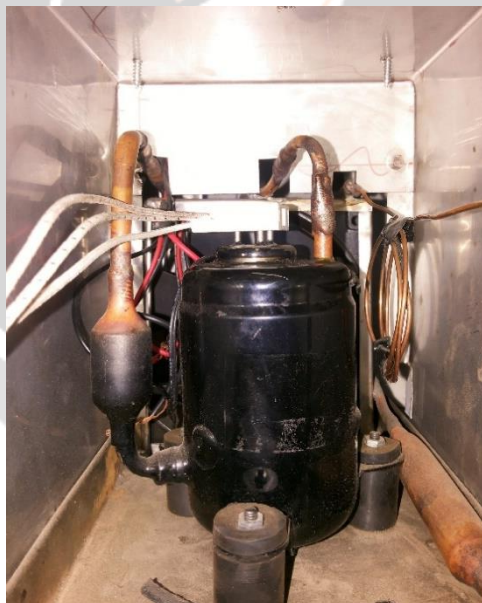
Fig -2: Internal connection diagram of jacket cool.

This refrigerant also requires the exclusive use of polyolester oil (POE) as a lubricant. R134a refrigerant is associated with strict requirements for internal cleanliness of the cooling system.